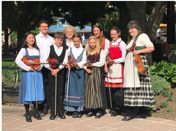
Boulder Spelemannslag, June 2019

At the same time, Boulder Scandinavian Dancers helped the group acquire a second new nyckelharpa. These two instruments were not the group's first nyckelharpas, but they were sorely needed, as the group had more experienced nyckelharpa players than instruments.